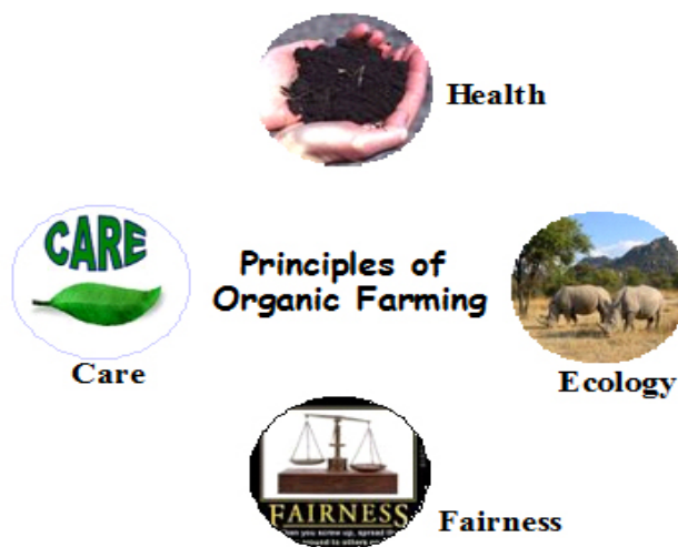
Figure 1. Principles of Organic Farming

The natural grown products don't have any harm and it has more value since it is health concerned. Since, the abandonment of certain inputs such as mineral fertilizers and pesticides this becomes more environments friendly. Sustainable development in organic farming will less pollute, water waste and optimum use of energy. This main motto of sustainable organic farming is about not consuming less, but better. Organic farming involves various benefits for the performance of society such as economic performance, social performance, and environmental performance. Agriculture is said to be the most important area of sustainable development where it extends to all human activities. Modern agriculture requires the replacement of more sustainable choice based on eco-Friendly agriculture.